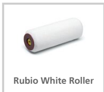
Rubio White Roller

The used tools must be cleaned with water after application.